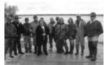
Volunteers gathered to release walleye into Long Lake.

The Long Lake Improvement Association is also working to combat the effects of zebra mussels and cormorants, which are further depleting the lake's fish population.