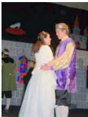
Fairview HS Choir students perform the musical Cinderella .

It was a magical night indeed as choir students from Fairview High School took to the stage to present Cinderella , the 2006 Oscoda Spring Musical.