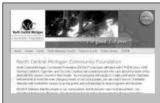
Pictured above is the homepage of NCMCF's new website at www.ncmcf.org .