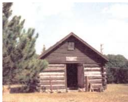
The Old Schoolhouse

The Oscoda County Library Endowment Fund is a designated fund that will support the agency as the Library Board deems appropriate. The fund was established by a donor who wished to leave a legacy that will support the community forever, providing constant income to the library.