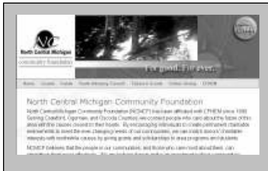
Pictured above is the homepage of NCMCF's new website at www.ncmcf.org .