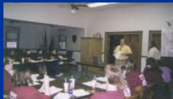
The Ogemaw YAC students listen as a grant applicant gives a presentation on his organization's project.

Each year, the students gather for several grant cycles to review grant applications from organizations seeking assistance in implementing