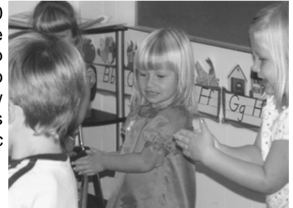
Students take part in the day's music session at Grayling Co-op Preschool.

Music and movement play an important role in child development, and with the help of a $300 NCMCF mini-grant, the Grayling Co-op Preschool was able to purchase new instruments and CDs for the students' music program.